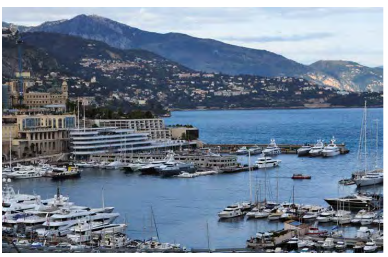
Yacht Club Monaco

Gstaad, Bucarest and Japan. Today it is a world leader in luxury living, operating through its subsidiaries in three main sectors: yachting, real estate, and radio.