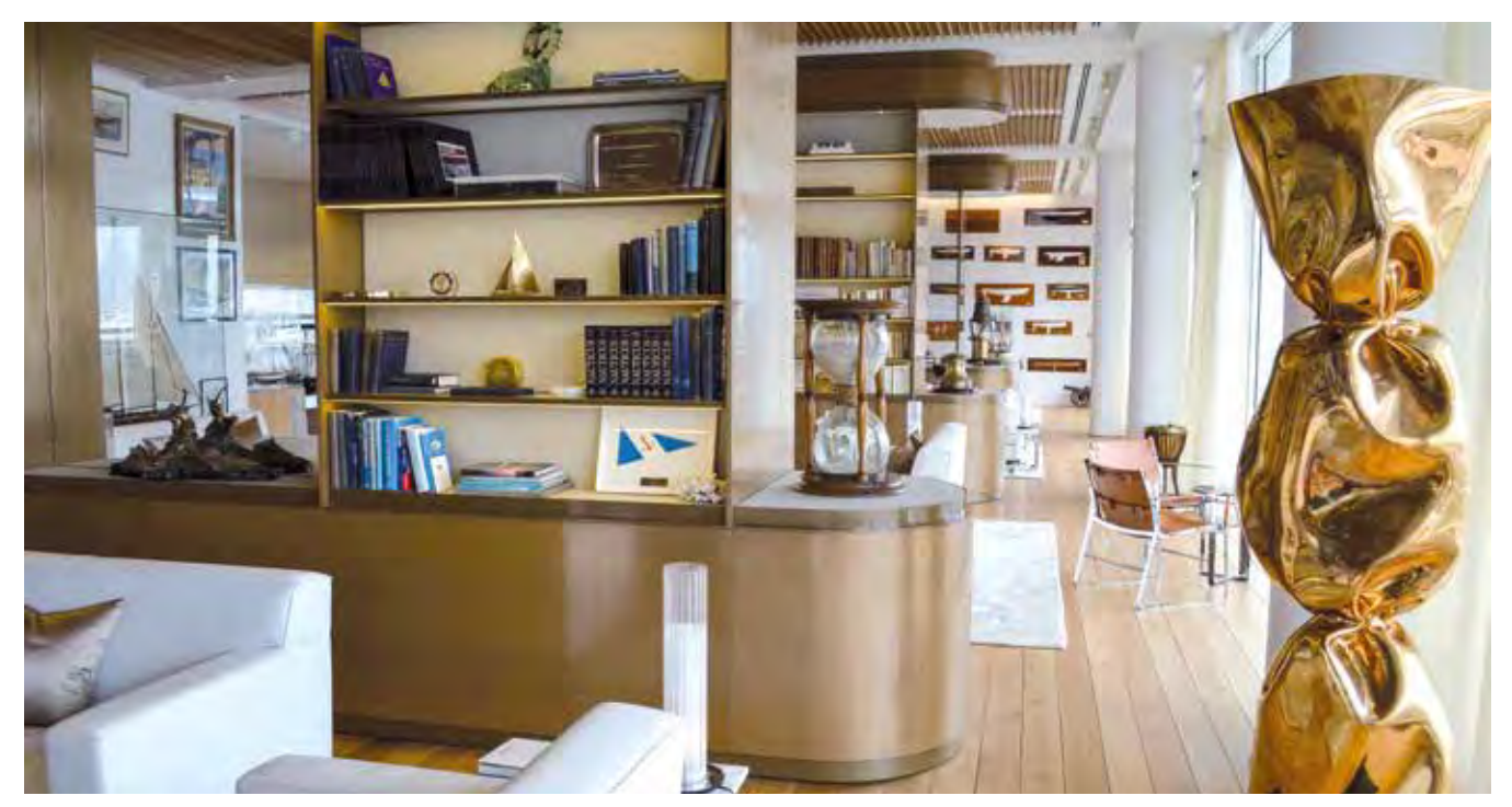
Inside the private clubroom of Deck Two at Yacht Club Monaco.

yacht-a 90-meter. With two kids aged seven and 12, I encouraged him to consider going smaller, say a 50-meter, because he could feel and experience the yacht better. With a more compact boat you have easier access to little beaches and harbours. You can learn about owning a yacht with a modest investment, and then decide if it's worth upgrading to a bigger boat. The best time you will ever have is the day you take your son out on the tender and run the boat yourself, something you don't get with the larger super crewed yachts. Essentially you are creating a totally different relationship with your son, one where you are the protector. So if you're talking about luxury, it's the time you spend with your son on the small yacht. Luxury is that moment.